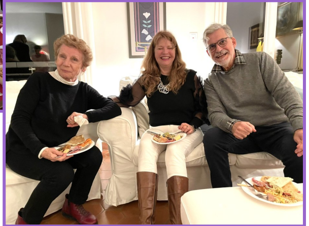
Sao Tome and Principe presentation Saturday Nov 30th