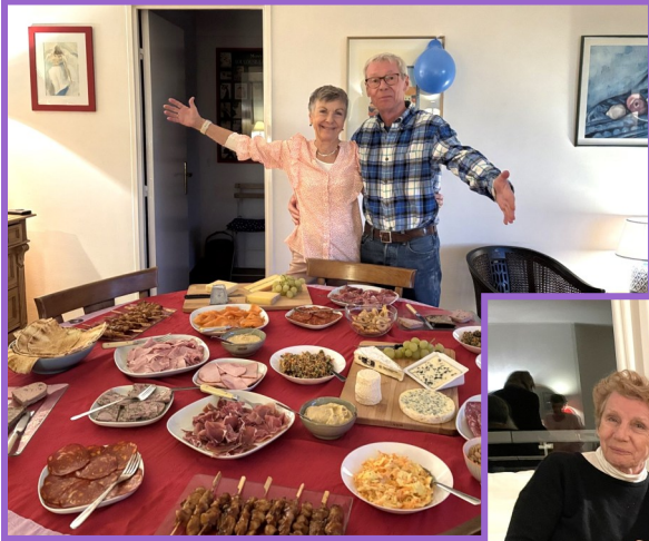
Beaujolais Nouveau Evening Friday Nov 22nd