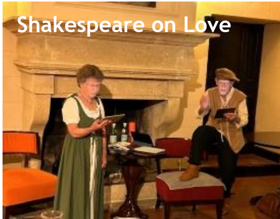
Shakespeare on Love